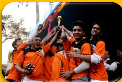
COLLEGE ANNUAL SPORTS