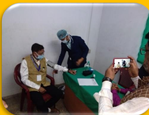
HEALTH CHECK UP CAMP